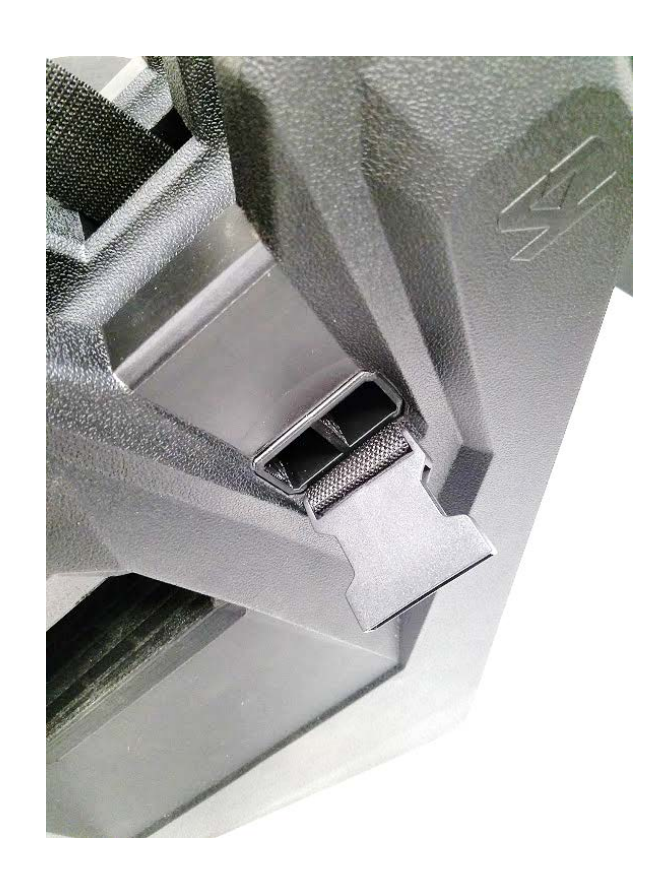
4. Insert the strap block into the hole. Push the block in until its flush and ensure the block is on top of the strap. (The strap should be underneath the plastic block.)