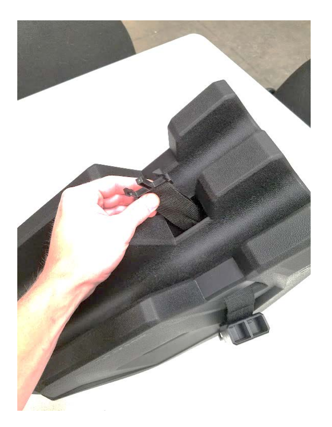
3. Insert the gun hold down straps as shown. Feed the male end of the buckle through the side hole and up through the middle top hole.