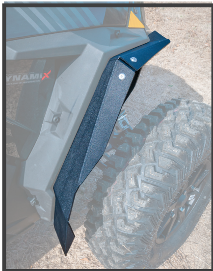
shown on RZR Turbo S

SET OF 2 FRONT AND 2 REAR FENDERS WITH MOUNTING HARDWARE