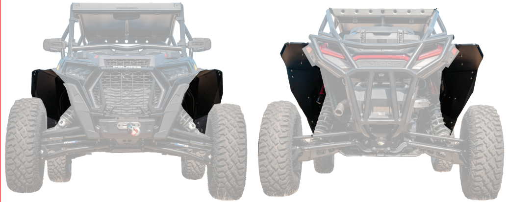
shown on RZR Turbo S